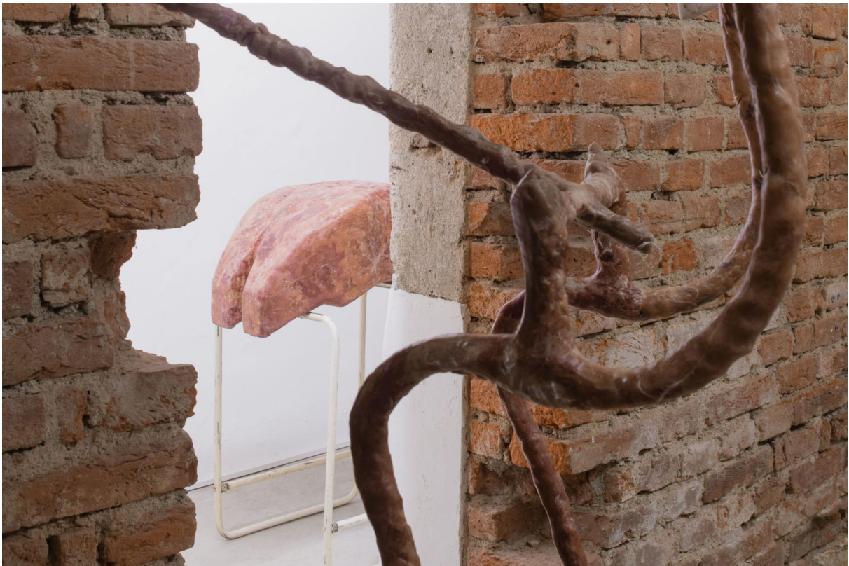
Laura Gozlan, Juveniles , Installation, variable dimensions, Metal structures, wax, dye, glassfiber, Acryl resin, plaster, clamps, video loop on lcd display, stereo, sound piece, stereo (2019)