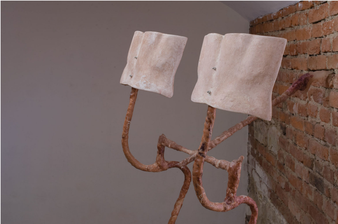
Laura Gozlan, Juveniles , Installation, variable dimensions, Metal structures, wax, dye, glassfiber, Acrystal resin, plaster, clamps, video loop on lcd display, stereo, sound piece, stereo (2019)