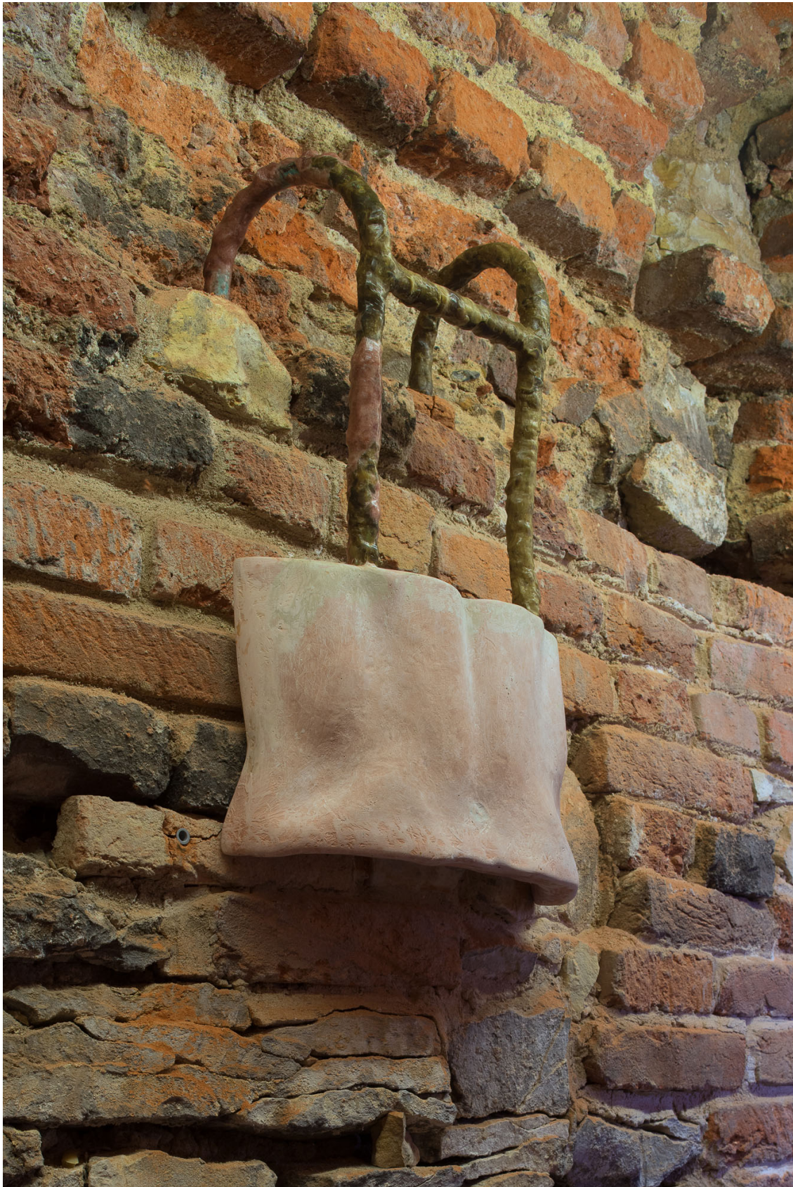
Laura Gozlan, Juveniles , Installation, variable dimensions, Metal structures, wax, dye, glassfiber, Acryl resin, plaster, clamps, video loop on lcd display, stereo, sound piece, stereo (2019)