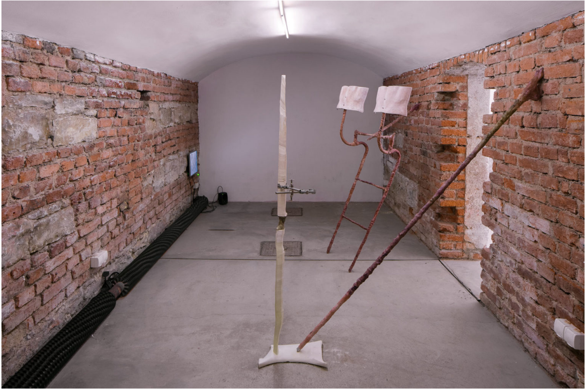
Laura Gozlan, Juveniles , Installation, variable dimensions, Metal structures, wax, dye, glassfiber, Acryl resin, plaster, clamps, video loop on lcd display, stereo, sound piece, stereo (2019)