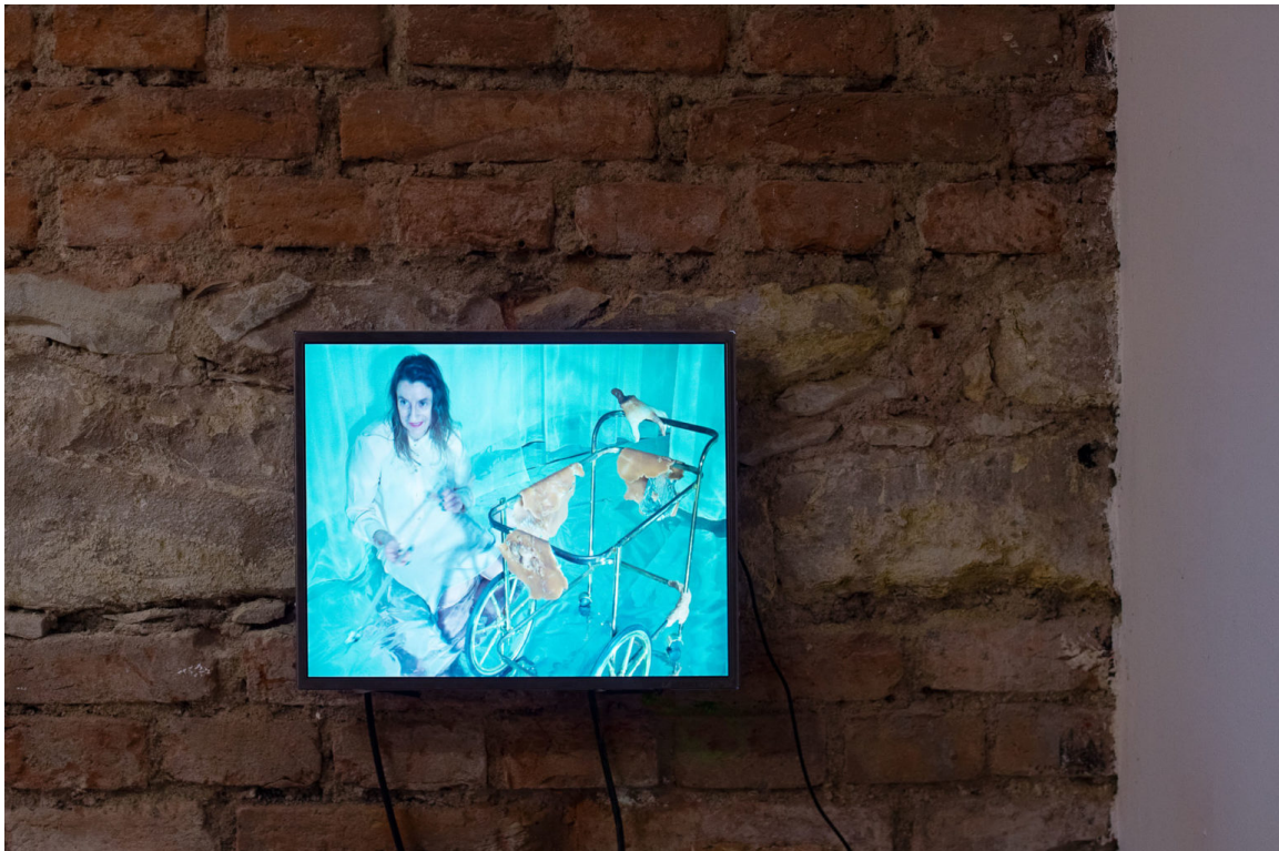
Laura Gozlan, Juveniles , Installation, variable dimensions, Metal structures, wax, dye, glassfiber, Acrystal resin, plaster, clamps, video loop on lcd display, stereo, sound piece, stereo (2019)