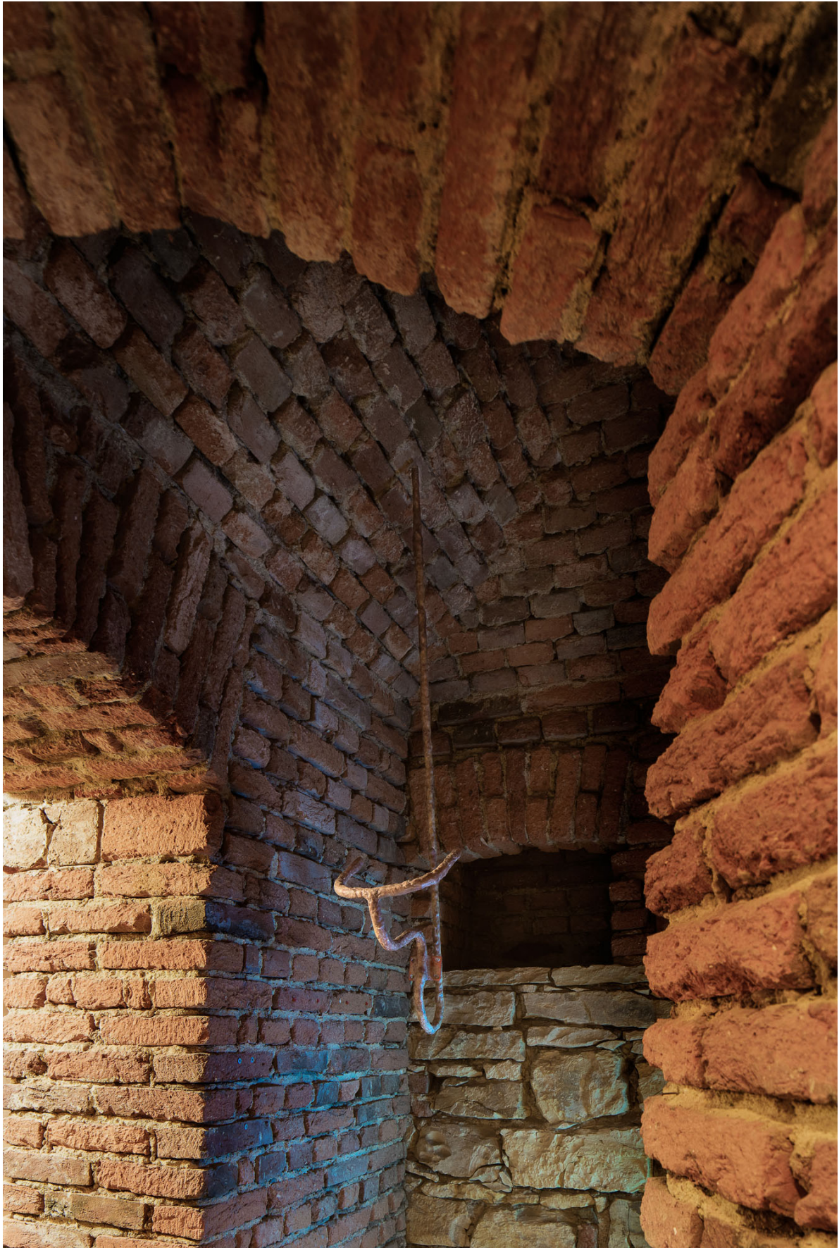
Laura Gozlan, Juveniles , Installation, variable dimensions, Metal structures, wax, dye, glassfiber, Acrystal resin, plaster, clamps, video loop on lcd display, stereo, sound piece, stereo (2019)