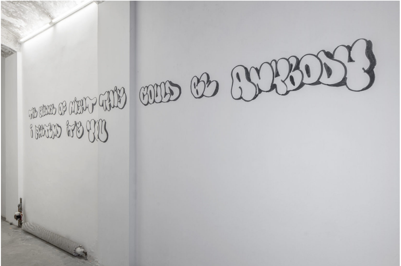
Thomas Moore, from the book "When People Die" (2018), Wall inscription by Radek Brousil (2019)