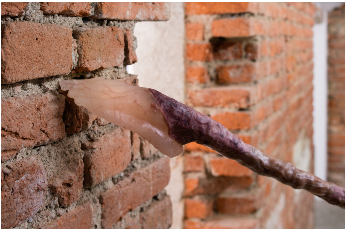
Laura Gozlan, Juveniles , Installation, variable dimensions, Metal structures, wax, dye, glassfiber, Acrystal resin, plaster, clamps, video loop on lcd display, stereo, sound piece, stereo (2019)