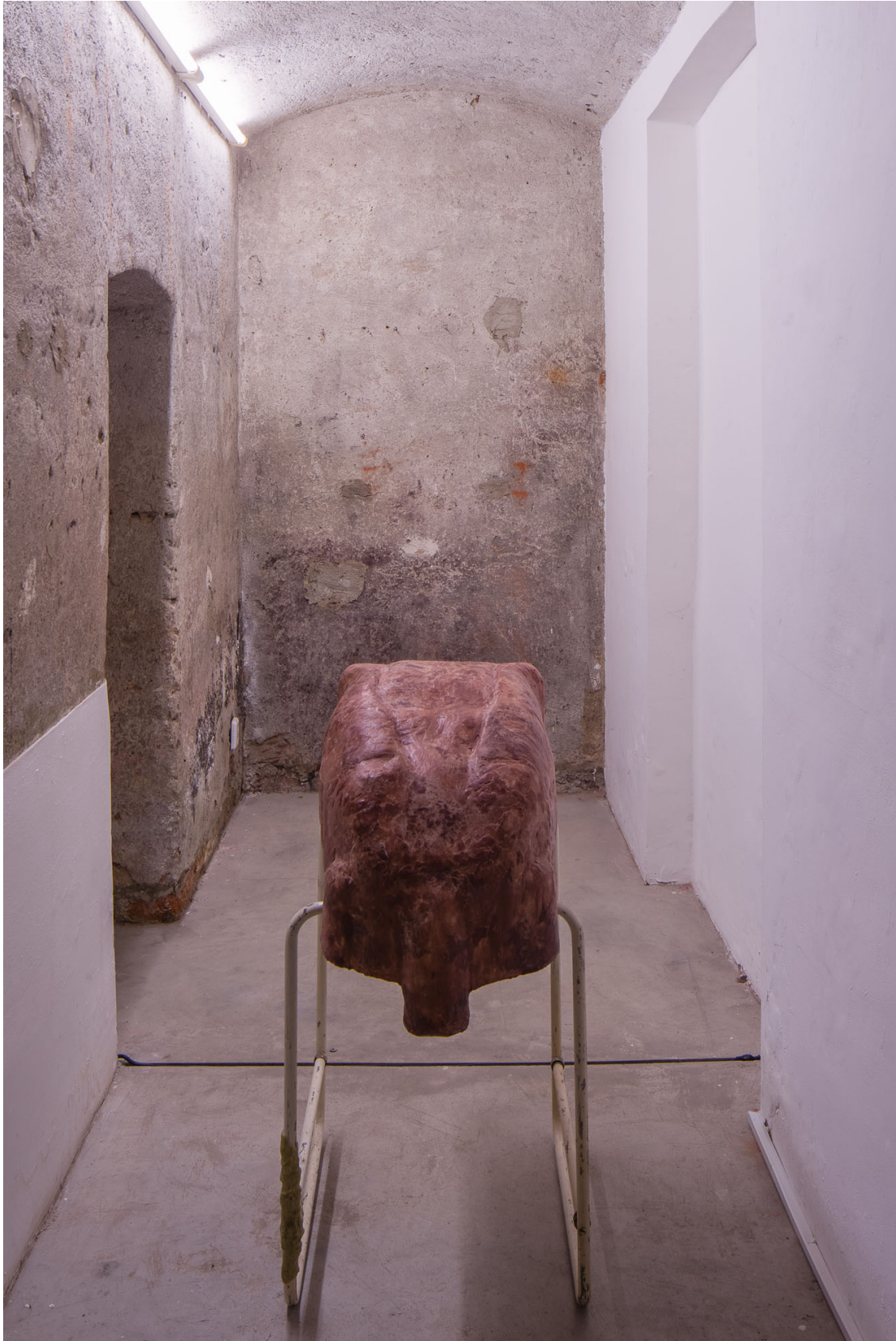
Laura Gozlan, Juveniles , Installation, variable dimensions, Metal structures, wax, dye, glassfiber, Acryl resin, plaster, clamps, video loop on lcd display, stereo, sound piece, stereo (2019)