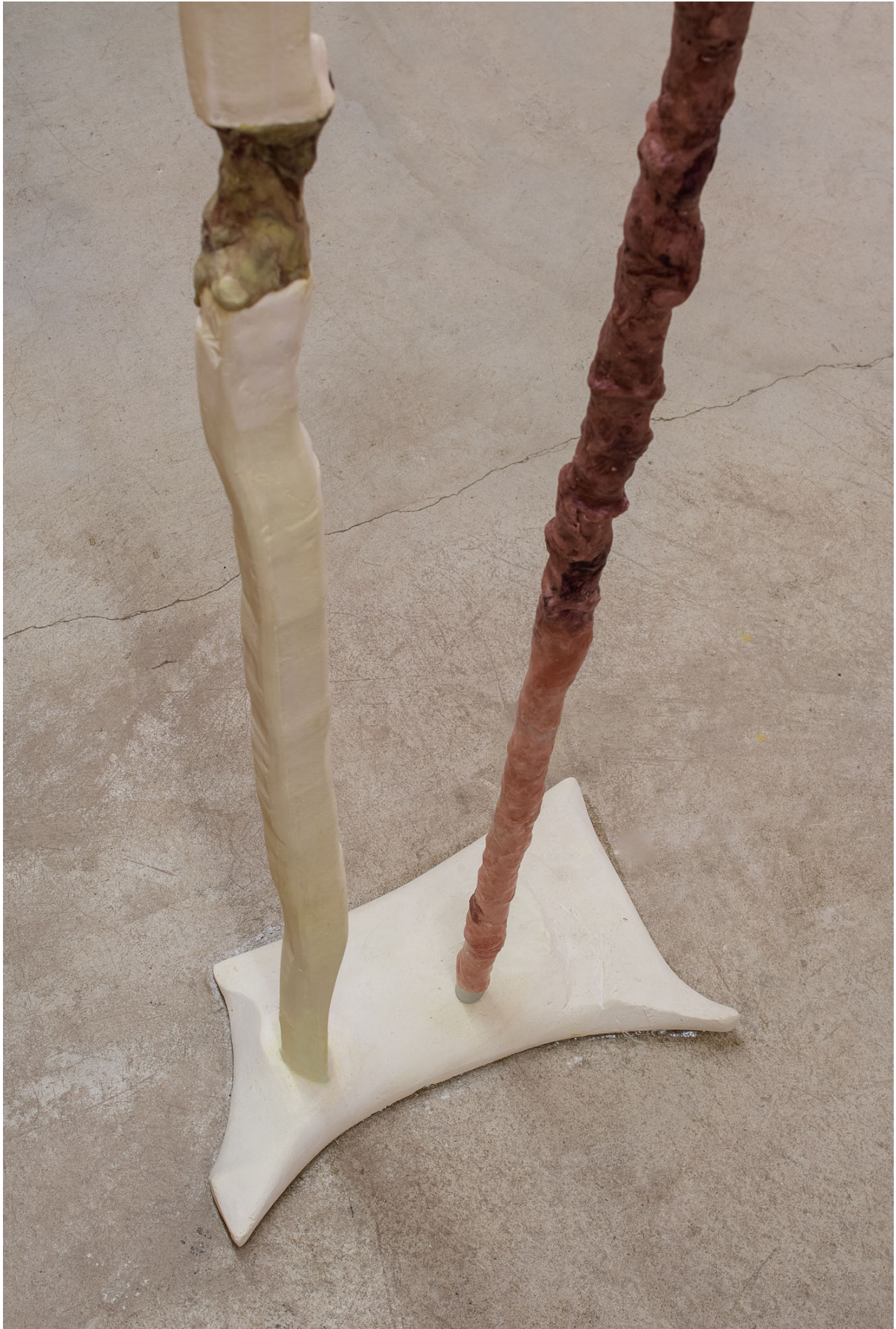
Laura Gozlan, Juveniles , Installation, variable dimensions, Metal structures, wax, dye, glassfiber, Acrystal resin, plaster, clamps, video loop on lcd display, stereo, sound piece, stereo (2019)